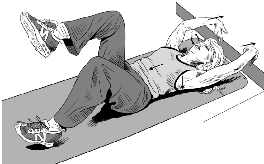
Figure 2 Functional abdominal exercise—alternate heel tapping.